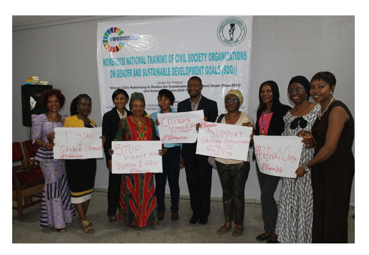
WEP Trains women-focused CSOs on Gender and SDGs - As the world commemorates another International Women's Day

The Federal Ministry of Water Resources also pledged to be holding twice a year, a coordination meeting with the Ministries of Health, Education, Finance, Women Affairs and Social Development and Ministry of Environment.