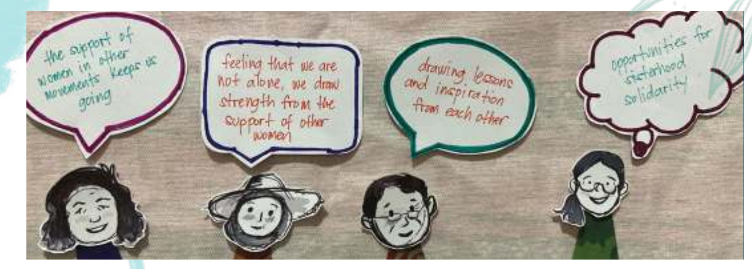
This collage represents the importance of building and strengthening solidarity. Solidarity that comes from learning together, supporting each other, and from taking action together. Collage by Cielito Perez